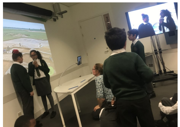
Spotted looking smart this week...

Monday 16 April - First day back after the holidays